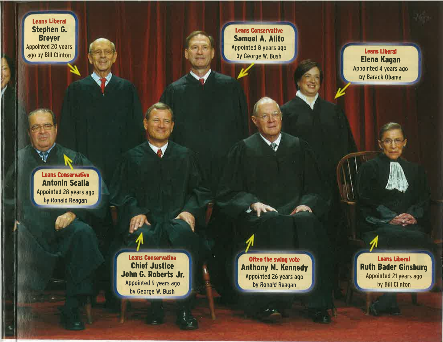
Leans Liberal Stephen G. Breyer Appointed 20 years ago by Bill Clinton